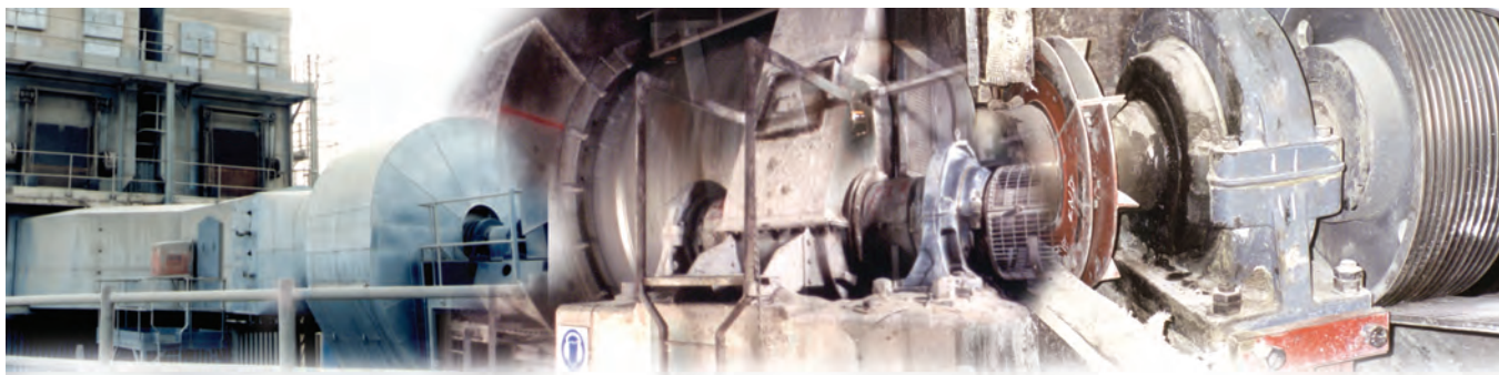
Ball Mill Bearings